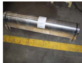
Single large bar