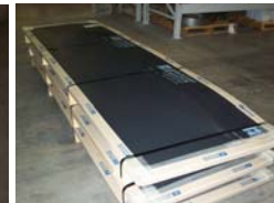
Int pallet with edge protection