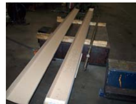
Compressed card board

Special packing requirements on customer request All woods used are steam treated to reduce contamination On customer agreement minimum material is used to reduce carbon footprint.