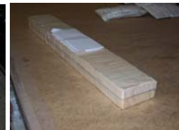
Wood pack with sealed edge

Special packing requirements on customer request All woods used are steam treated to reduce contamination On customer agreement minimum material is used to reduce carbon footprint.